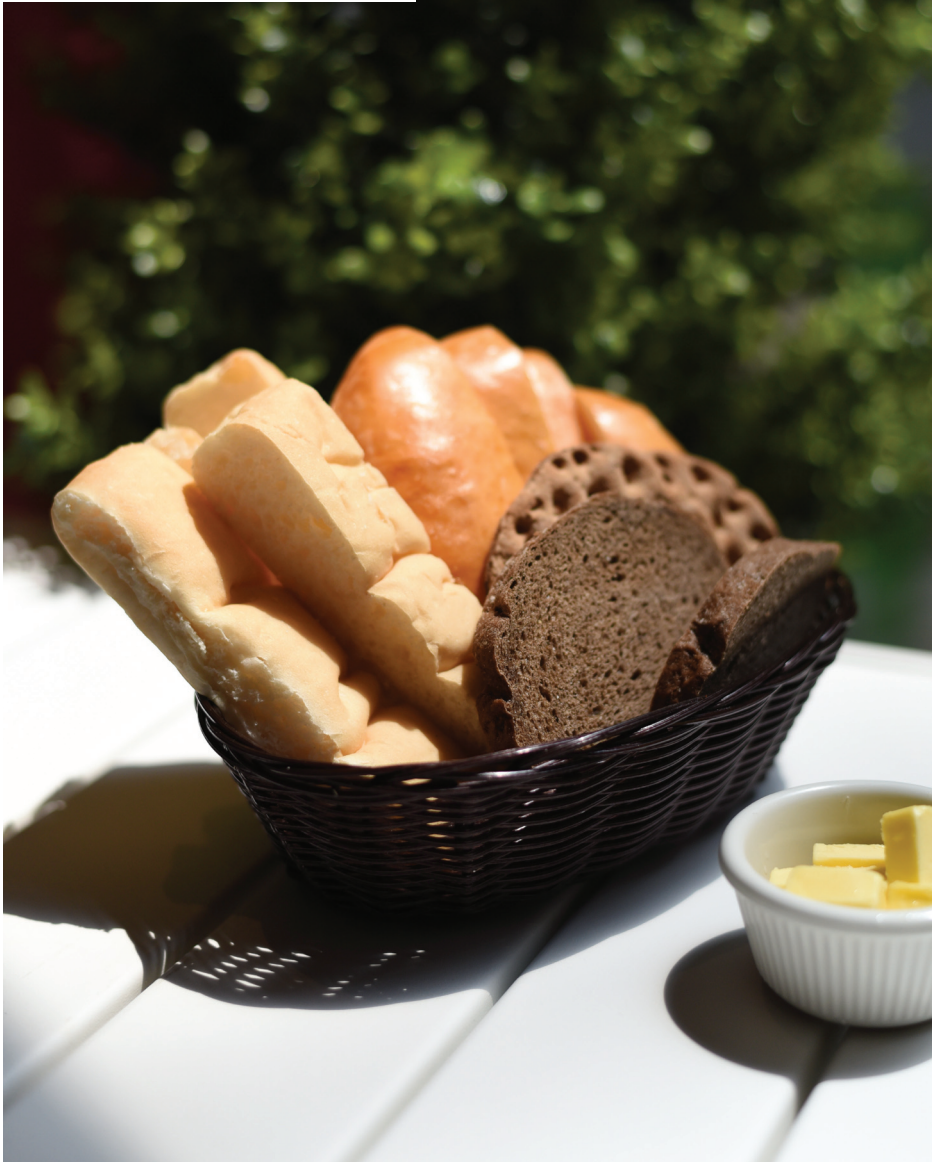
fika swedish café and bistro

Assortment of breads, served with butter.